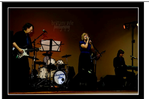
Something Blue Band

*Auction items included: Weekend Getaways, Pamper Packages, Local Artwork ... And More!